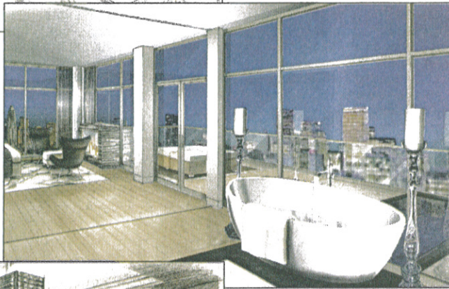
Design by Patty Xenos